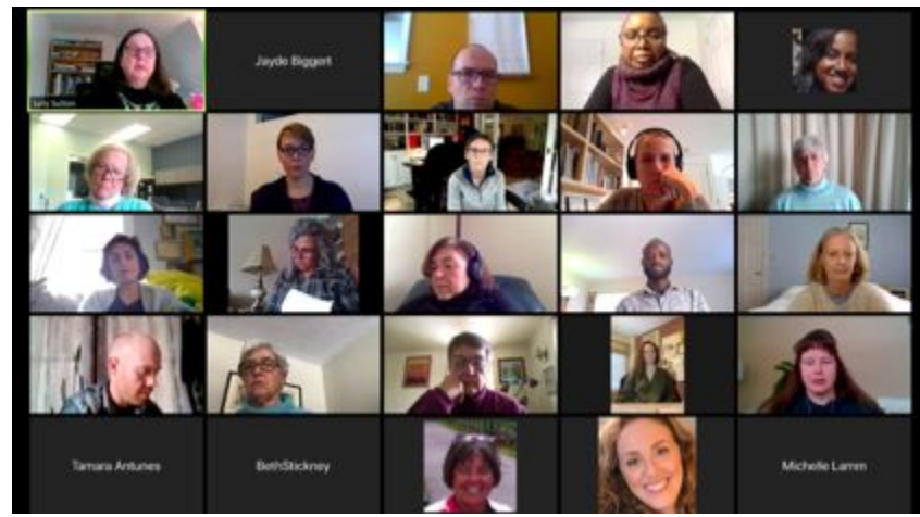
February 5 th ASWG Meeting